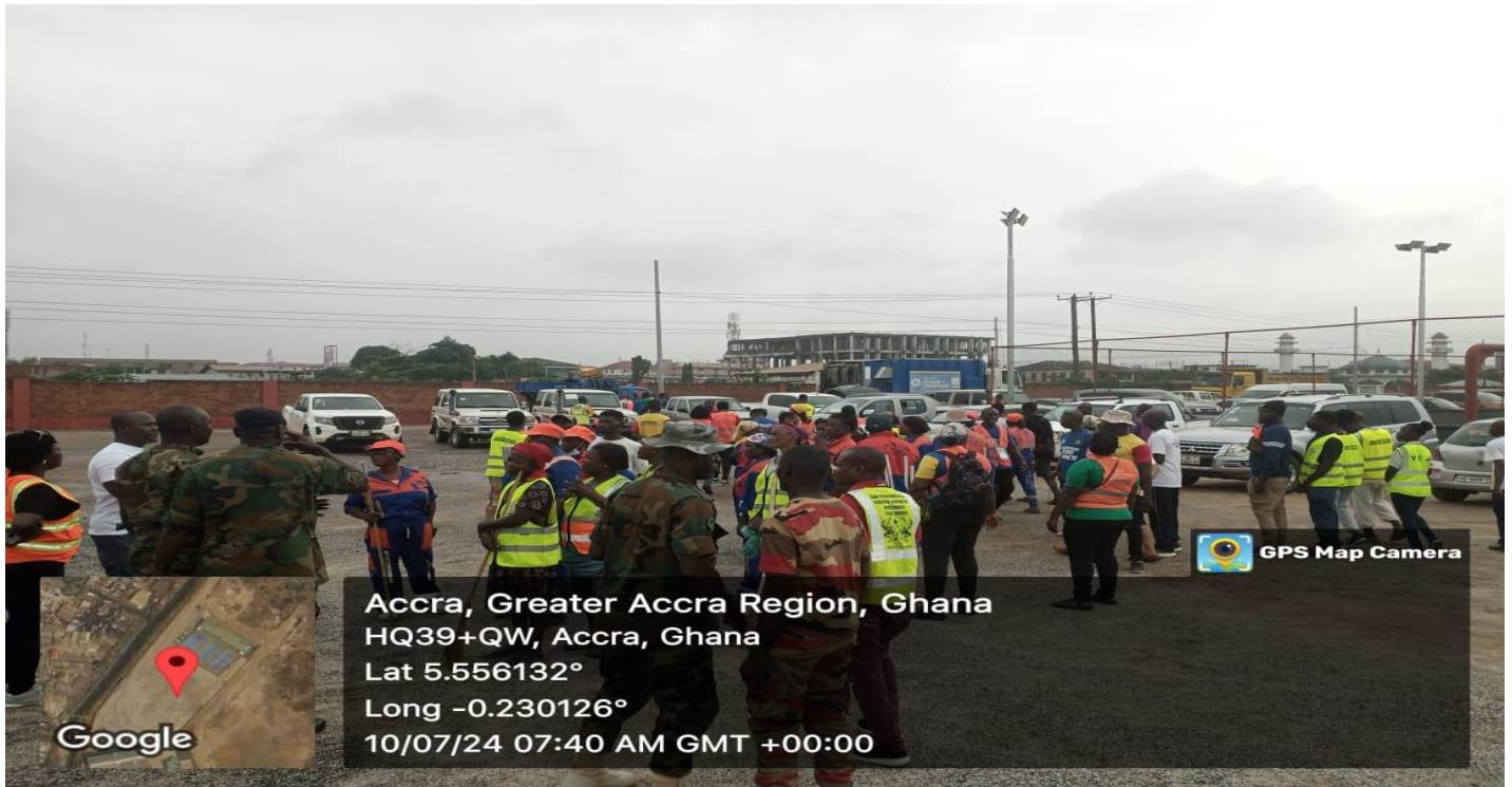
Distribution of teams to their working area