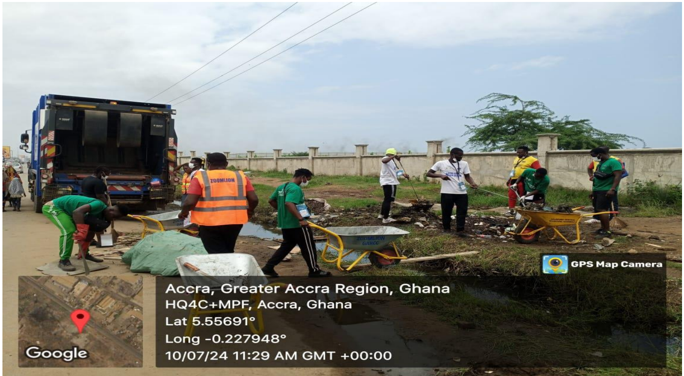
Loading of refuse into the compaction truck