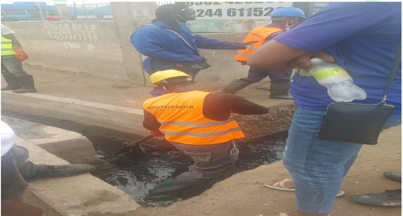
Work in progress