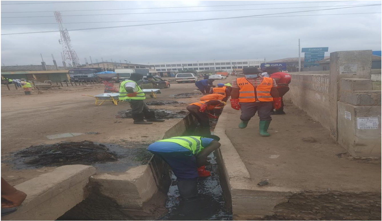
Work in progress