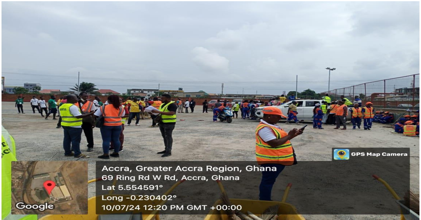
Field officers started reporting back from the field