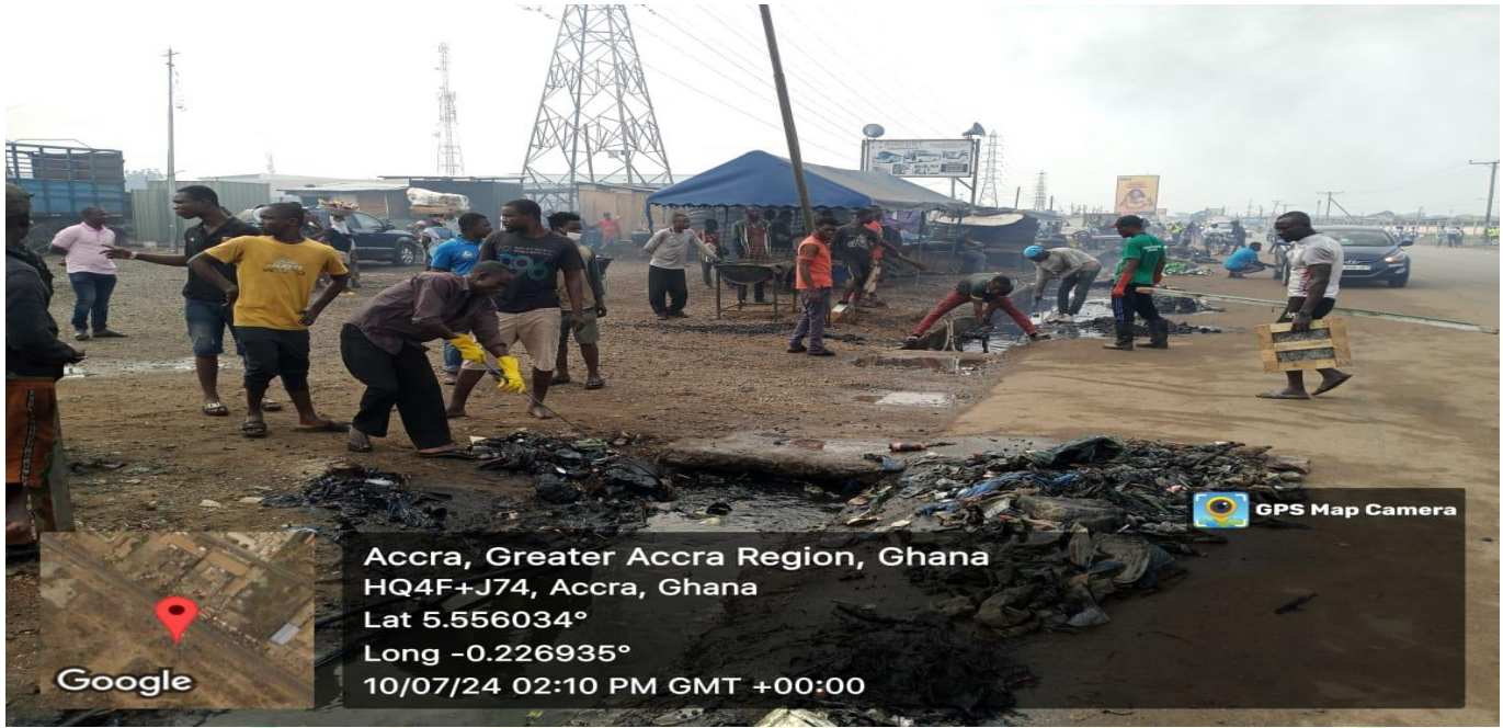
Some shop attendants in action