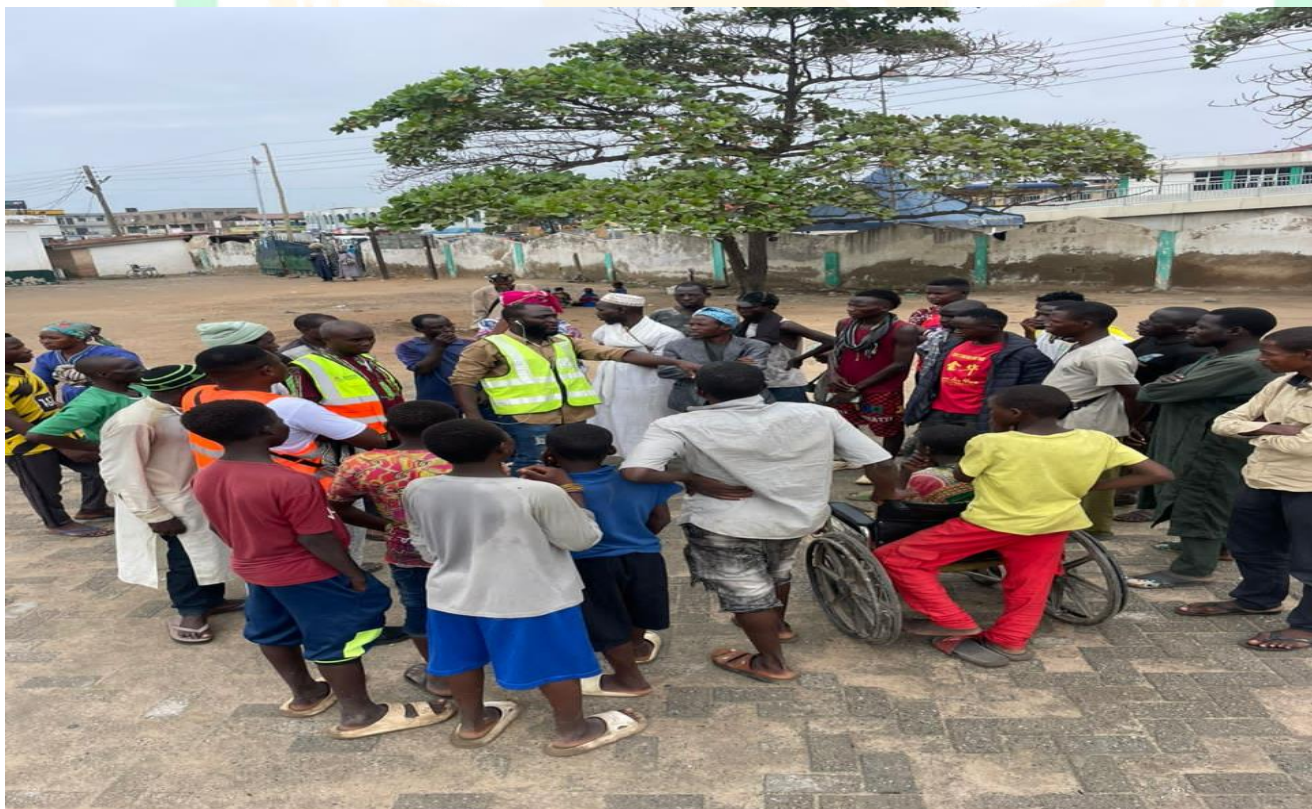
Some officers engaging children and foreigners at abossey okai central mosque