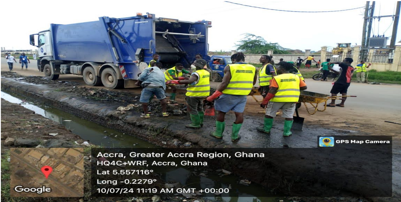
Loading of refuse into the compaction truck