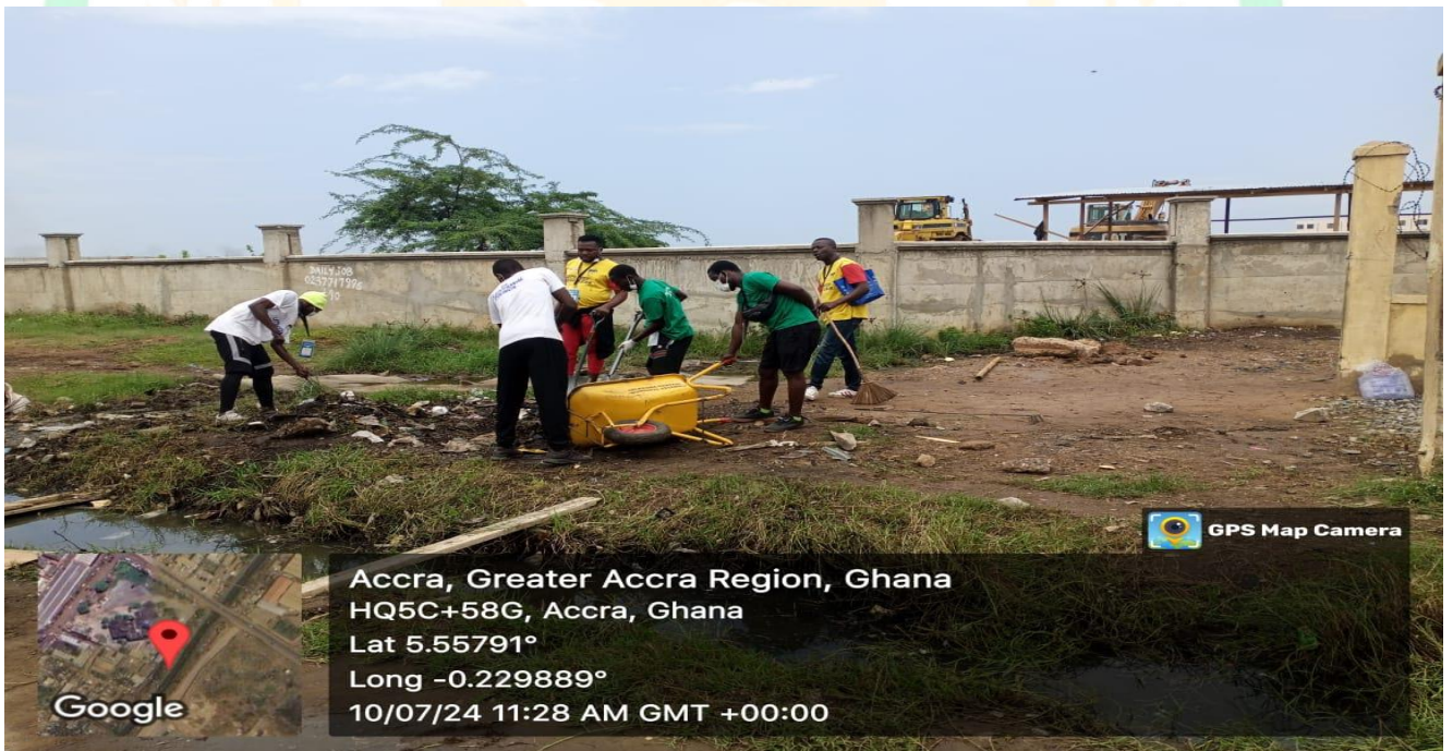
Collection of refuse